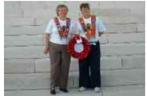
The Wreath laid at the Canadian War Memorial on Behalf of the LOBA of Canada