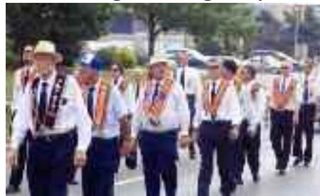
Members of Peel & Brampton LOL #5 marching in the Orange Heritage Day held in Brampton.

The first parade held in Brampton since the 1960's was quite successful. The Parade was followed by a Bar-b-que and refreshments. The members of LOL#5 hope to make this an annual event!