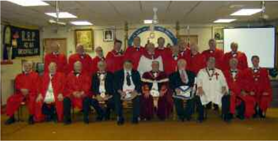
Members of the Combined Red Cross Degree Team