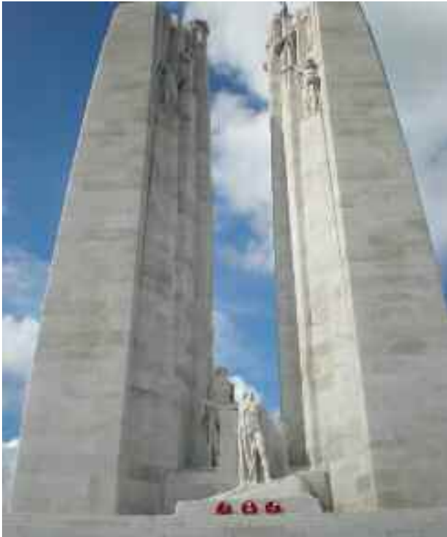
THE CANADIAN WAR MEMORIAL AT THE SOMME