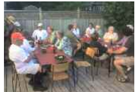
Allandale members and extended family enjoy a BBQ to fundraise for local school.