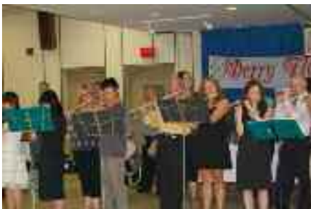
This year marks the 100th Anniversary so the band celebrated their success with a party at the R.C.L. Centennial Branch No. 614.

The band was founded in 1908 by a group of Irish immigrants from the County of Londonderry. From its humble beginnings in a chicken coop on St. David's Street, in the Parliament & Dundas area of Toronto, it has changed from a fife & drum band to a six part harmony flute band.