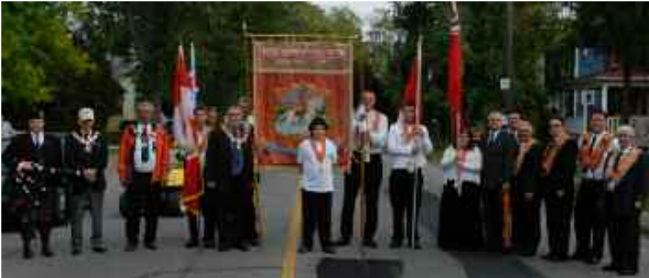
Members of Niagara Falls LOL#998 at the Niagara Grape and Wine Parade September 27th in St Catherines.