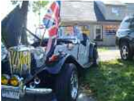
Bro. Johnston (in car) also provided a replica of an old MG. Note the GOL of ON West "Support the Troops" ribbon on the grill

Vimy LOL #2697 participated in the Whitby Heritage Day on Sept. 20th, a fun event for the whole family with a sidewalk sale, wagon rides, games and lots more. The lodge set up a table with the Canadian Red Ensign flag of 1917 (the flag used at Vimy Ridge), and passed out information on Vimy Lodge as well as the Lords Prayer bookmarks.